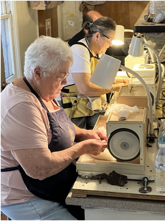
Workshop attendance picked up on August 17 th . All machines taken!