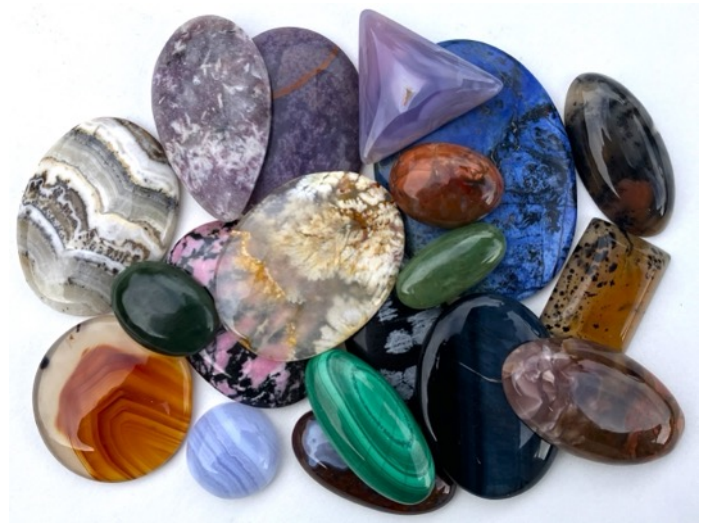
See what's being crafted in the club's workshop studio!