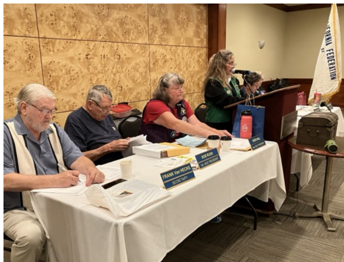
Want to see how sausage is made? Attend the CFMS Fall Directors Meeting in Visalia!

- Want to head to a local club show this fall? The CFMS Newsletter lists about 15, including a half dozen or so that are within very reasonable driving distance from Ventura (San Luis Obispo, Sept. 28-29; Long Beach, Oct. 12-13; Woodland Hills, Oct. 19; American Opal Society in Orange, Oct. 26-27; San Diego, Nov. 2-3).