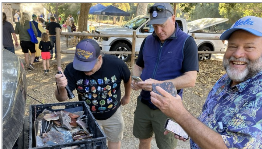
Hope to see you at Rocktoberfest!

Rocktoberfest will be held on Sunday, October 27 th at our VGMS clubhouse grounds (11969 N. Creek Rd., Ojai). We need volunteers to help set up pop-ups, chairs, etc. at 8 a.m. Breakfast is served at 9:30, Silent Auction 10:30-11:45, Tailgating 8 a.m. - 1 p.m. Clean-up and close at 1 p.m. Please RSVP if you are attending in any capacity at http://whosbringingwhat.com/vgms .