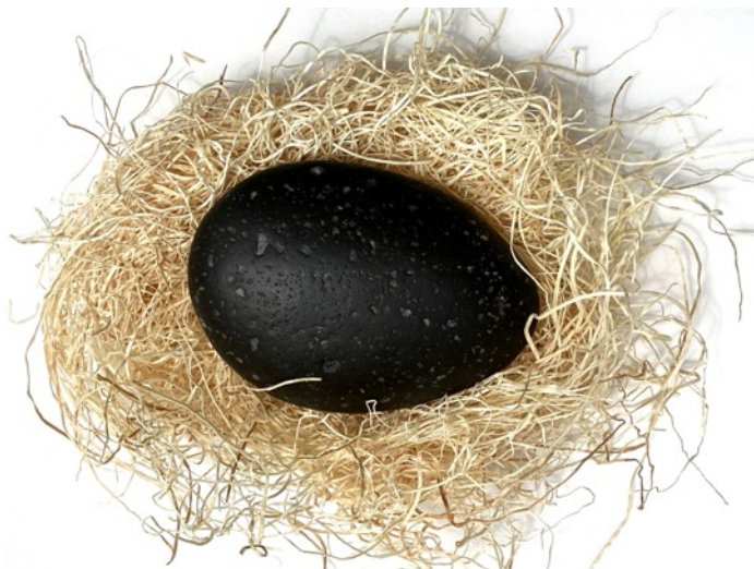
The original Pet Rocks came on a bed of straw in a box with holes for air.

Collect Rocks Day was first celebrated in 2015 and is held every year on September 16 th to celebrate Earth, geology, and all manner of rocks to be found wherever you live. No one seems to know who started it or why, but we are all urged “to indulge your inner geologist.” That might be by going on a collecting field trip, visiting a museum’s geology collection and gift shop, or relishing a bowl of Rocky Road ice cream