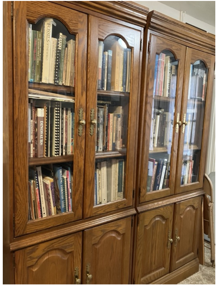
Sssshhhh! Work is in progress to winnow our library collection.