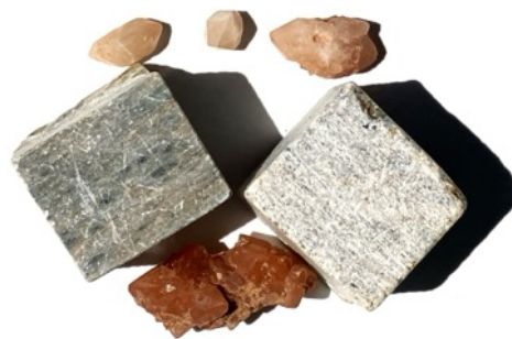
We challenged kids this month with a “diamond that’s not” and a block of soapstone.