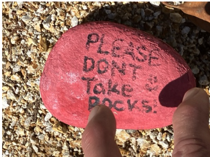
Let no one tell you that you can't collect rocks at Mussel Shoals on Collect Rocks Day!